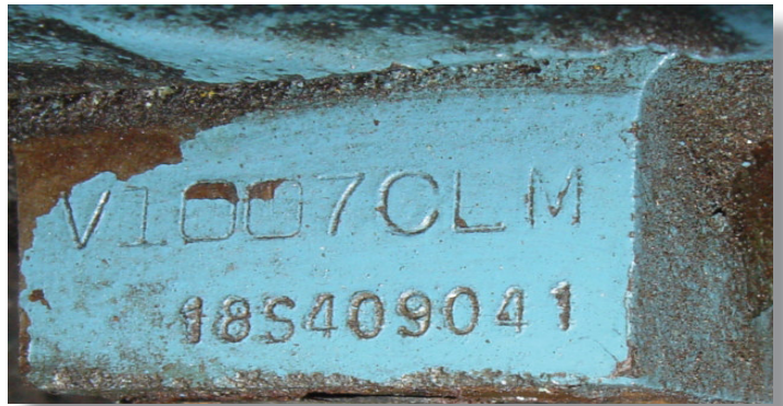
Figure 3: L48 VIN Stamp Pad - October 7, 1977

Rochester built the Quadrajets for Chevrolet and twelve carburetor applications were listed for Corvette use in 1978. Figure 5 shows Carb GM # 17058204 with broadcast code BHT which indicates this carb was