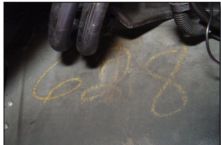
Figure 8: Body Underbody Panel Assigned #628

But matching numbers and date codes can be identified and tracked for numerous components and while this article has shown the major components, date codes can be documented for horns, mufflers, rear gear, distributor and many more parts. Equally important to a Corvette's authenticity, are the broadcast codes that can be reconciled with a build sheet or other reference materials that list a model year's broadcast codes.