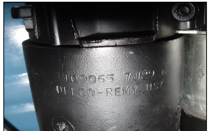
Figure 7: Delco Remy Starter

Delmy Remy also supplied starters for Corvette. A typically starter coding as shown in Figure 8, is 1109065 7 J 29 2 while finishes have been observed to be either natural (and now rusted) or semi-gloss black paint. The part number is followed by a digit for the year (7) letter for the month (J), two digits for the day (29) and the last digit “2” is the shift. VIN 09041 (Figure 7) was equipped with GM# 1109065 for a Corvette with automatic transmission with an assembly date of September 29, 1977.