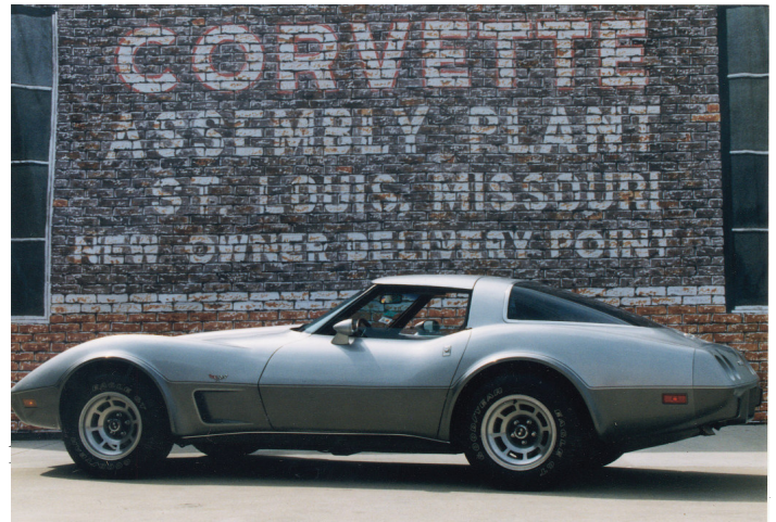
Figure 1: 1978 Silver Anniversary Corvette NCRS National Convention, St Louis, 1998

A third set of numbers that assist with authenticity and is expected to reconcile with VIN derivatives stamped