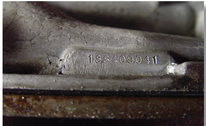
Figure 4: M38 Stamp Pad - VIN Derivative