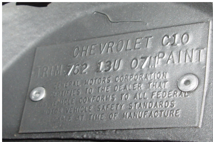
Figure 2: Trim Tag for VIN 09041

on the engine and transmission are the date codes and broadcast codes on mechanical components of significance such as alternator, carburetor, distributor and smog pump (when equipped). But date coding begins with the trim tag riveted to the driver's side inside door jamb. The trim tag date code for this 1978 is C10 (Figure 2) and indicates the tag was installed on a completed body assembly November 10, 1977. Thus, it is typical of factory production that the mechanical components should be coded with a date that precedes the November 10 th date.