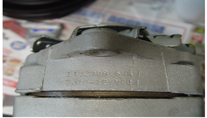
Figure 6: Delco Remy Alternator VIN 09041

tor installed on VIN 09041 is GM# 1102908, a 63 amp alternator matched for vehicles equipped with air conditioning. Figure 6 shows the natural aluminum case with date code 7J which translate to September 1977.